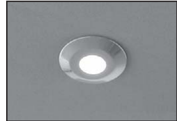
DEC-LF2 Bullet Lens